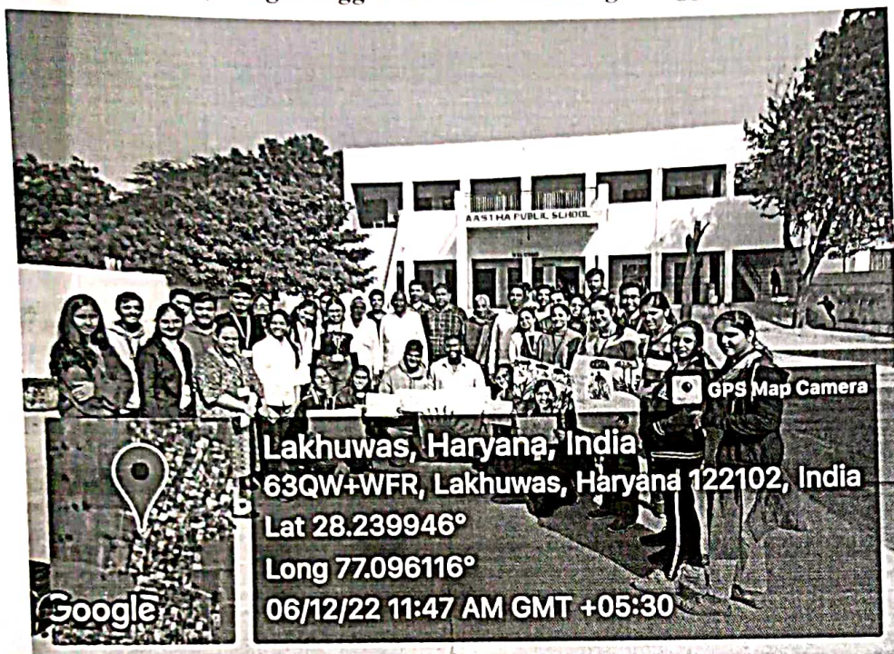
Photo 1- Students of School of Journalism and Mass Communication with farmers.

Please add Pics (non-geo tagged for social media /geo tagged for NAAC)