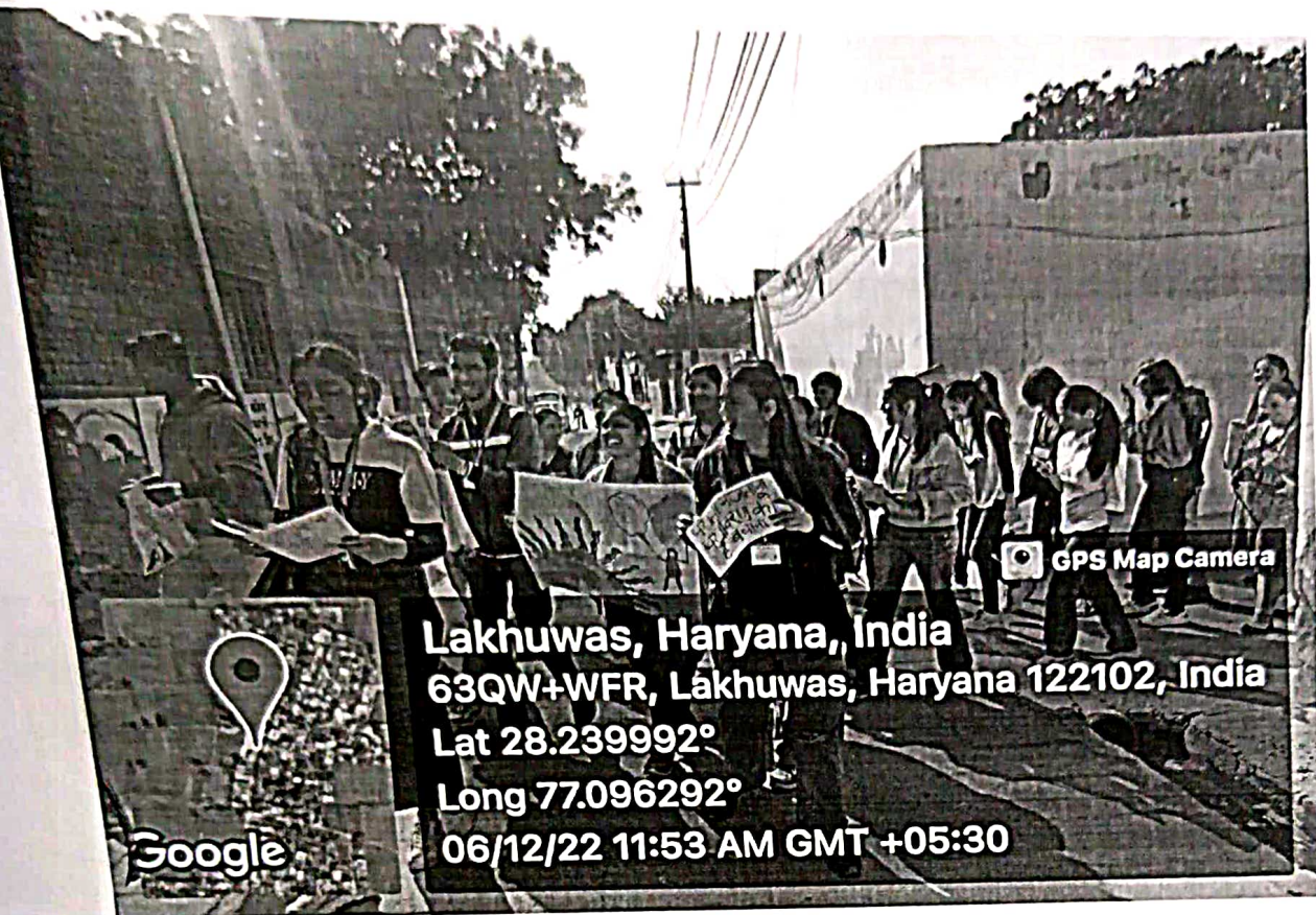
Photo- 5- Students doing awareness rally on stubble burning and environment protection.

List of Participants with attendance: Enclosed in separate sheet