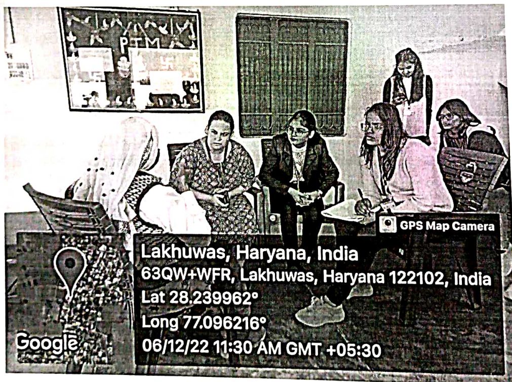
Photo 4- Students conducting interview of villagers