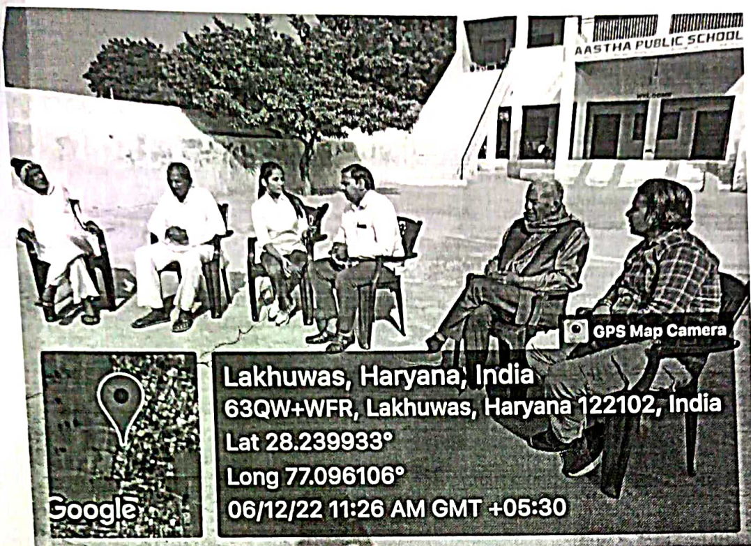
Photo 3- Focus group discussions with villagers.